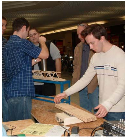
UPEI Engineering Students weighs and pre-test bridges prior to contest.