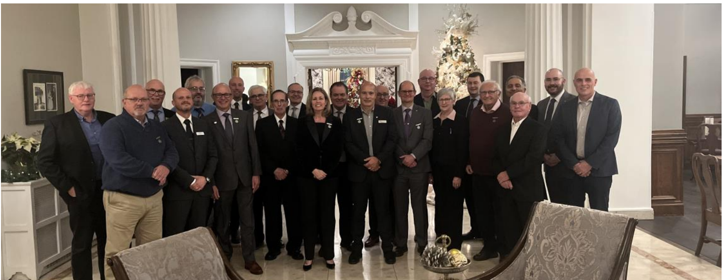
Some of the Past Presidents at the 2022-2023 Engineers PEI Annual General Meeting Awards Banquet