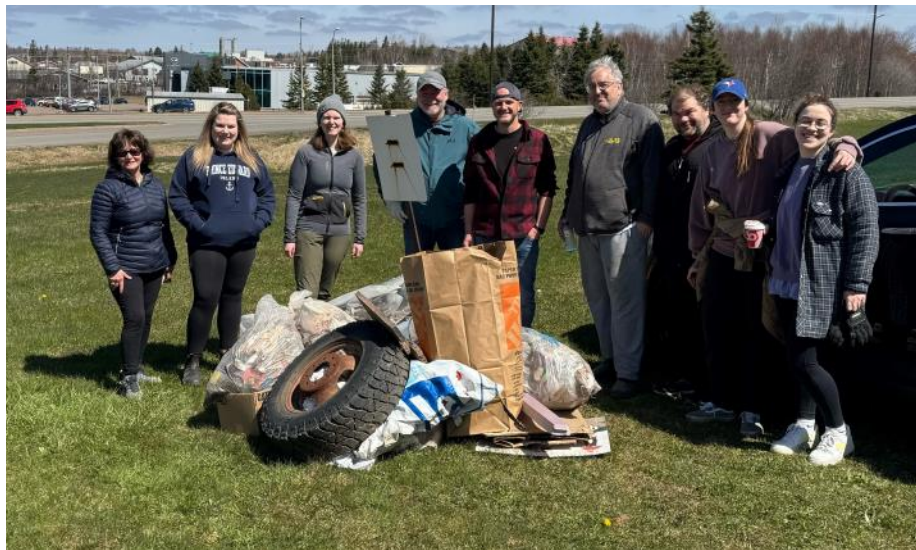
Volunteers from Coles Associates taking part in the 2024 Women’s Institute Roadside Cleanup.